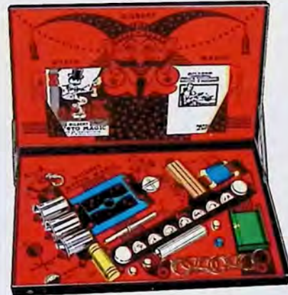
No. 5 GILBERT MYSTO MAGIC

An assortment of ingenious and mystifying tricks from all countries that will hold an audience spell-bound for two hours. Famous Dice in the Box Mystery, Magician's Rhapsody, Glass and Bottle Transposition, Handkerchief Casette Trick, Drum Head Tube Trick, Acrobatic Wedding Ring Trick, Vanishing Handkerchief Trick. Contains Magic manual, also books on Handkerchief Tricks, and Knots and Splices that describe many additional tricks. Complete with magician's moustache, goatee and poster.