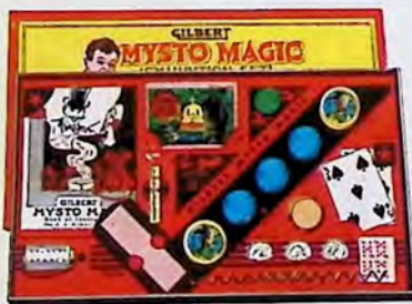
No. 1 GILBERT MYSTO MAGIC

Mystify Your Friends: Be a Magician. You Can, One Hour After You Get a Gilbert Mysto Magic Set. Crammed With Mysterious Baffling, Intriguing Tricks You've Never Seen Before.