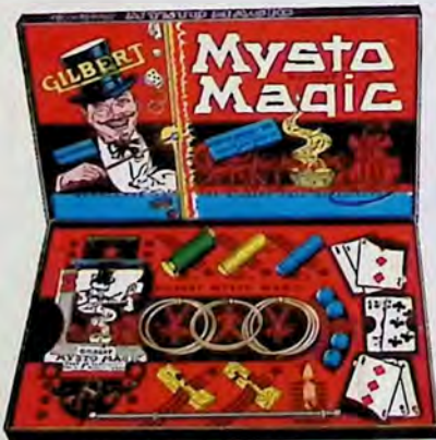
No. 2 GILBERT MYSTO MAGIC

This set brings you 12 startling and mystifying tricks, plus a magician's moustache and goatee to make your shows more realistic. Tricks include famous Ming Toy Laundry Ticket, Mysterious Vanisher, New Ace Trick, Sphinx Card Trick, Multiplying Billiard Balls, Jumping Peg, Svengalia Mind Reading Wonder, Mysterious Linking Rings, and others.