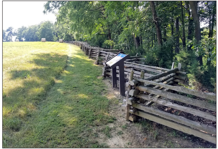
The Artillery Ridge Trail at Cross Keys Battlefield.

Friday, July 17 — 6:00 - 8:00p — Dinner Buffet at Western Sizzlin’s Wood Grill Buffet (1711 Reservoir St, Harrisonburg, VA 22801).