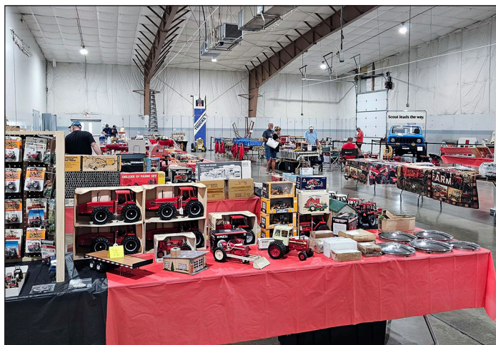
Inside the Exhibit Hall at the Fairgrounds.

As a convention bonus, all attendees will receive the Society's newest publication— The Member's White Truck Models booklet—with the history and dozens of photos of White Truck models (see page 3). Be sure to visit www.acghs.org for all the latest 2026 Convention news.