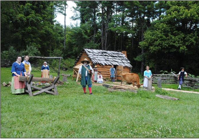
Living history re-enactors at The Frontier Culture Museum.