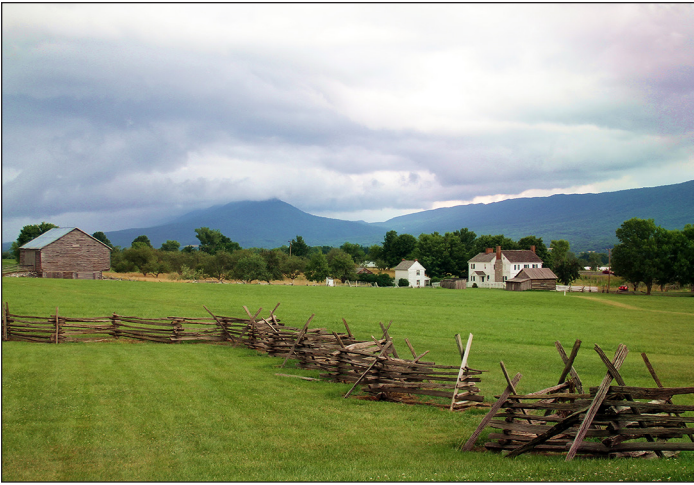
View of the Shenandoah Valley near New Market.