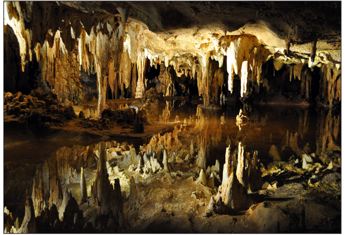
Dream Lake—the largest body of water in Luray Caverns.

Cost is $20 per person. Mark your Registration Form and pay in advance.